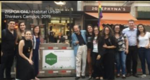
ZISPOA ONU-Habitat Urban Thinkers Campus, 2019