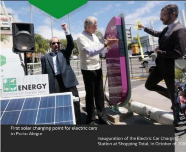
First solar charging point for electric cars in Porto Alegre